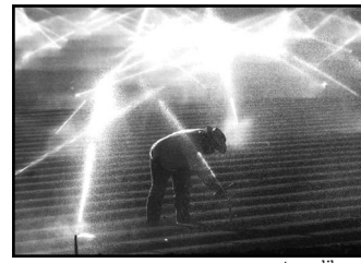
REGULATIONS: Farmer adjusts his sprinklers.