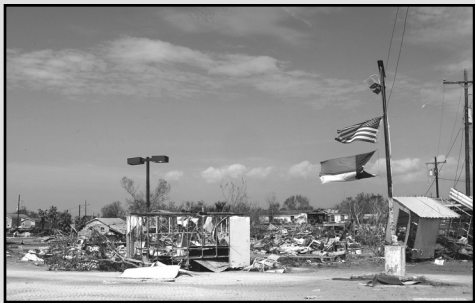
STORMS: Gulf coast of Texas damaged after Ike and Gustav.

Summertime has been dangerous for Louisiana and its bordering areas for the past few years. Hopefully, however, our response will continue to improve if events like these continue to occur. From what we have seen this summer, between Gustav, Hanna, and Ike, Americans can expect more of these deadly cyclones in the future. (Sources: www.cbs11tv.com, CNN, news.nationalgeographic.com)