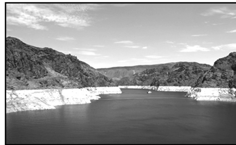
DROUGHT: Water levels drop to lowest in over 30 years.

California has been faced with a huge issue to solve but investing in water conservation now will ensure a reliable water supply into the future. (Sources: San Jose Mercury News, Los Angeles Times, The Christian Science Monitor)